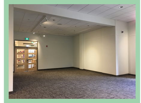
Temporary Gallery - Room A (space will be empty)