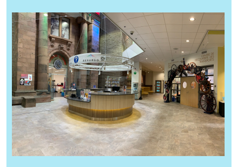
Entrance Lobby (reception desk immovable)